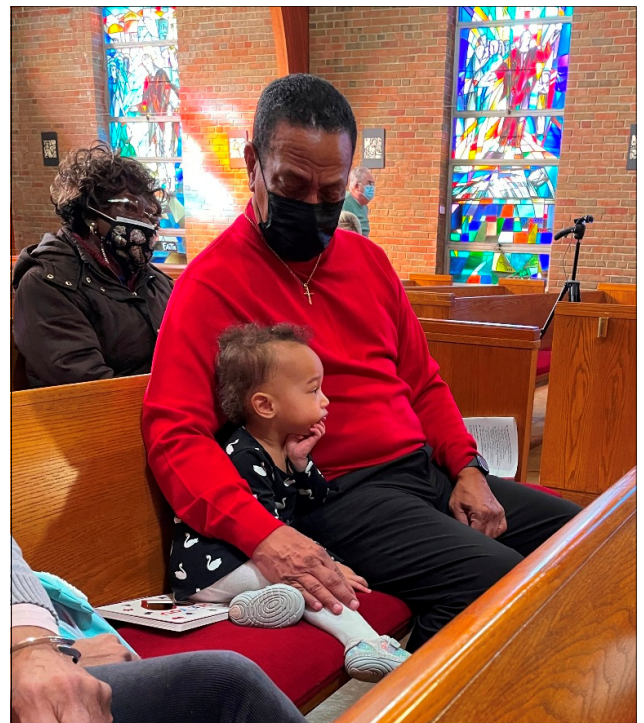
Who better to listen to the sermon with than Grandpa?