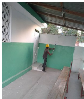
Front entrance and waiting area.

The atmosphere in Haiti is still very troubling. The government, what remains, is not stable, inflation skyrockets, civil unrest, robbery and kidnappings are still occurring much too frequently. Our brothers and sisters in Mirebalais need our help more than ever!