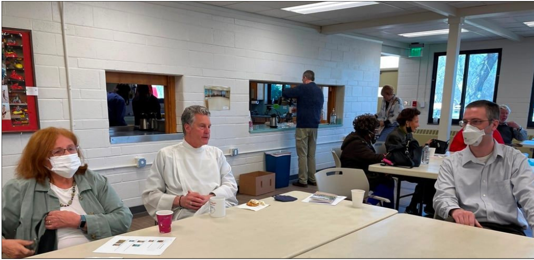
Coffee hour is back!