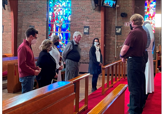
Dedicating our newly formed Healing Prayer Ministry.