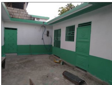
Back courtyard of clinic. Patients wait here for their medications or to see the dentist in /dental clinic at right.