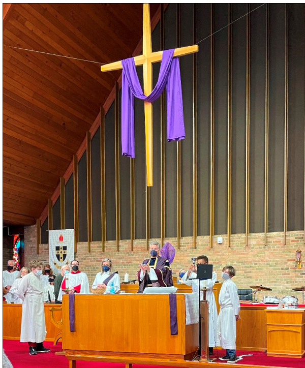
The cross is draped in purple for Lent.