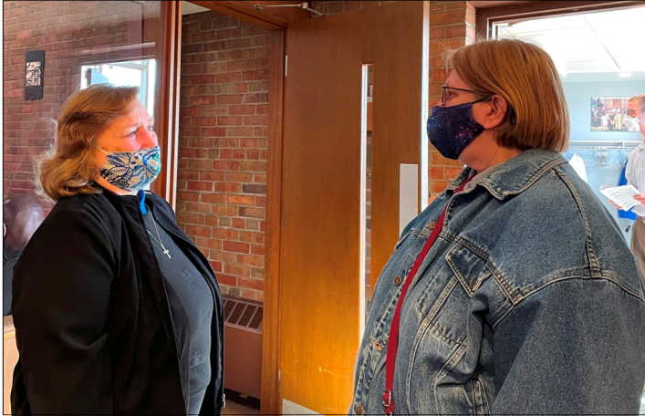
Greeting each other on the first Sunday of Lent..